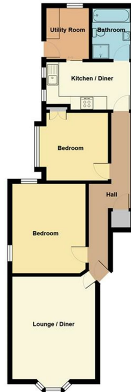
7, Lake Road, Lytham St Annes, FY8 1BE

John Ardern & Company for themselves and their clients declare that they have exercised all due diligence in the preparation of these details but can give no guarantee as to their veracity or correctness. Any electrical or other appliances included have not been tested, neither have drains, heating, plumbing and electrical installations. All purchasers are recommended to carry out their own investigations before contract. Details Prepared May 2025